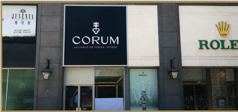
冠亞名表城 北京 澳門中心 崑崙 專賣店 Timecity Beijing Macau Center Corum Boutique