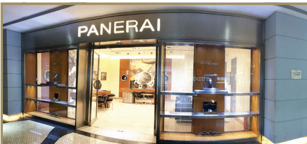
冠亞名表城 北京 澳門中心 沛納海 專賣店 Timecity Beijing Macau Center Panerai Boutique