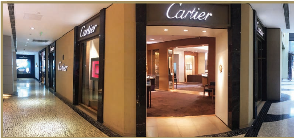
冠亞名表城 北京 澳門中心 卡地亞 專賣店 Timecity Beijing Macau Center Cartier Boutique